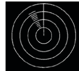
Radar view SART at 2 miles