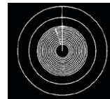
Radar view SART very close