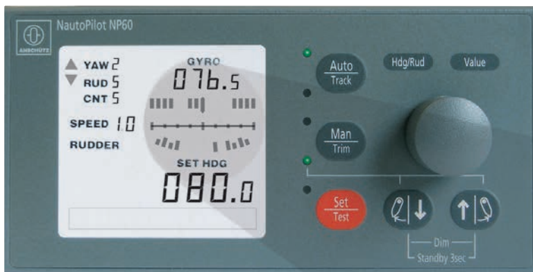
All important information at a glance

A watch alarm is user definable. It can be reset directly from the NP 60. An audible and visible alarm is given if the limits in heading control or waypoint steering are exceeded or speed and heading sensor information are disturbed.